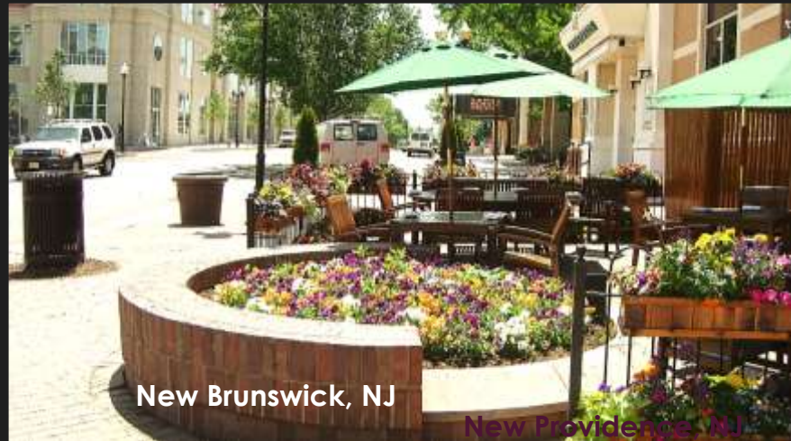
New Brunswick, NJ