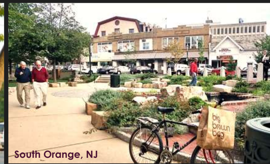
South Orange, NJ