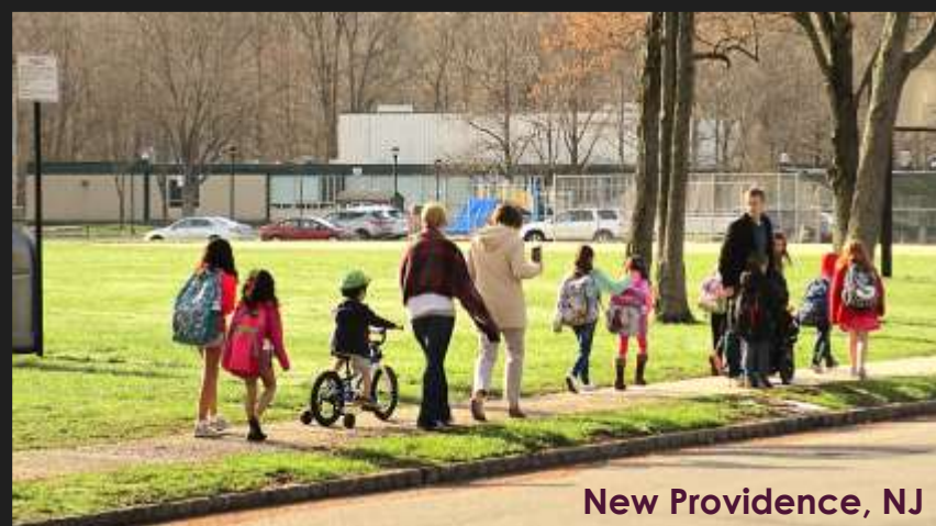
New Providence, NJ