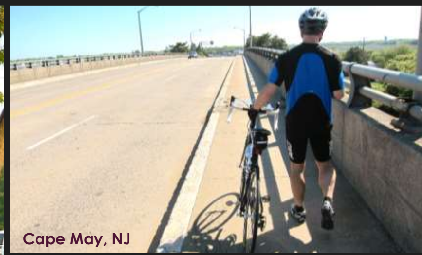
Cape May, NJ