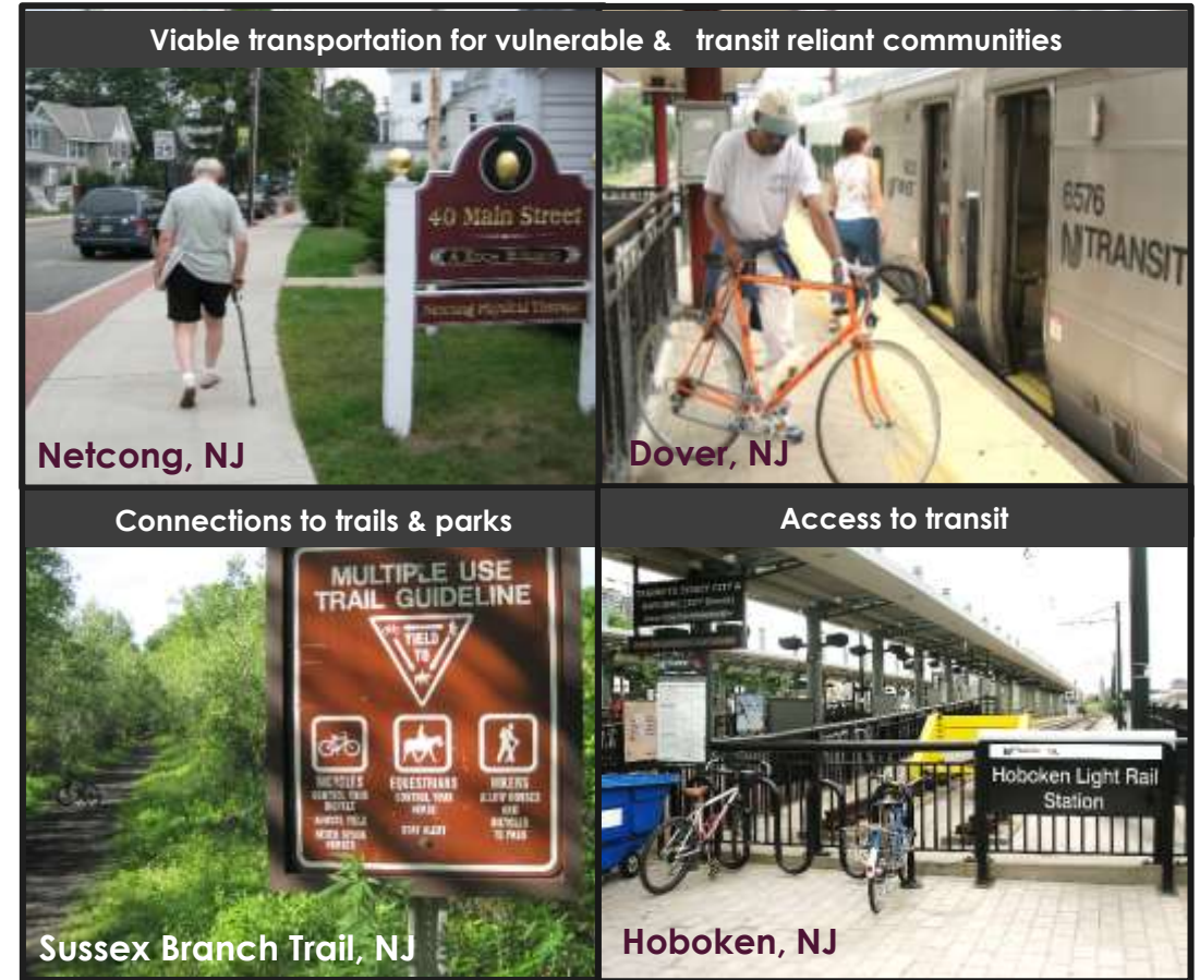
Viable transportation for vulnerable & transit reliant communities