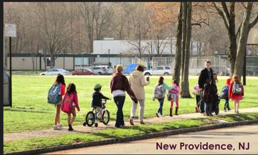
New Providence, NJ