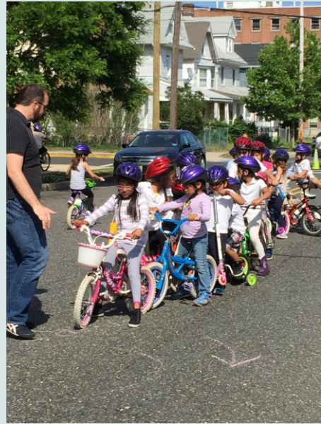
A Bike Rodeo in Asbury Park, conducted by Meadowlink TMA

While support for more inclusive events was universal among the coordinators surveyed, several noted specific concerns. One such concern was the potential difficulty in anticipating the details of implementing a successful inclusive event, such as determining level of teacher or aide support needed and how to best adapt planned events for students with a range of disabilities. Regarding this last point, coordinators expressed desire for more specific information on how they could best involve students with diverse disabilities and how they could adapt their presentations with the appropriate terminology and messaging to avoid offending or excluding anyone.