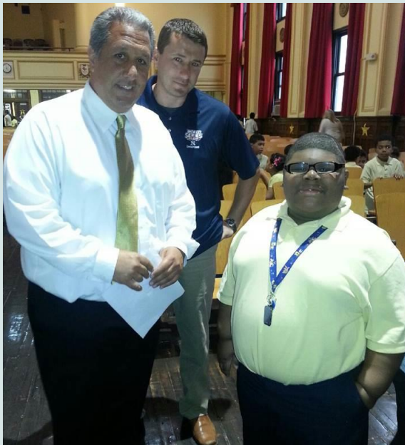
Hudson TMA's Golden Sneaker contest in Jersey City, NJ

cognitive disability accompanied by his parent participated in a bicycle rodeo with his adaptive bicycle. The Coordinator remarked that he was unsure how to best engage and accommodate this student whom he had met the day of the event, therefore he was grateful for the parent's presence and active involvement.