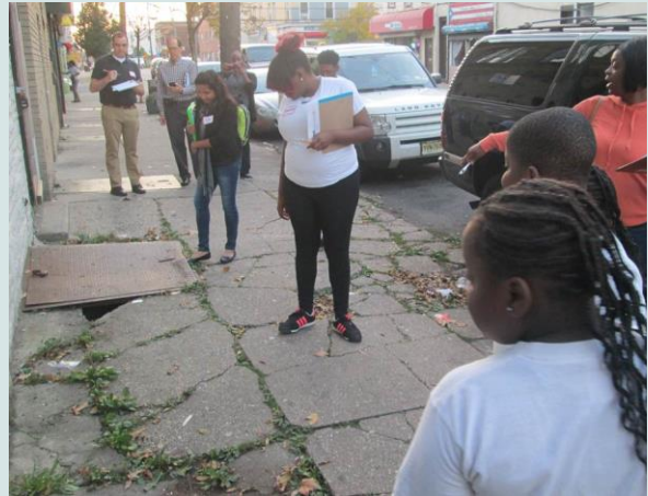
Meadowlink TMA assists with a Walkability Audit in Elizabeth, NJ

Requests were made for additional inclusion training for SRTS Coordinators. Specifically, several interviewees requested a training session to discuss topics including strategies to involve students with disabilities in SRTS activities, how to best use the requested informational resources, and identification of tools/equipment that would be useful when conducting inclusive events. Several interviewees noted that such a session would also provide a forum for Coordinators to collectively discuss and brainstorm opportunities to enhance program inclusiveness.