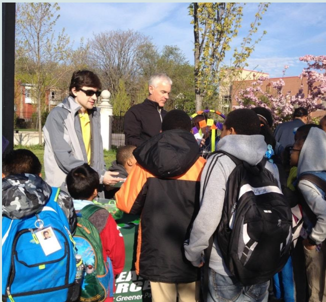
GMTMA conducts SRTS outreach

Another concern expressed by several interviewees involved the potential issue of violating the confidentiality of a student's Individualized Education Program (IEP), if the SRTS coordinator seeks to learn more detail about a student's particular disability in an effort to better adapt a SRTS program for that individual student. Other coordinators also expressed concern about how to address the potential hurdle of securing involvement of students with disabilities in walk to school events on a regular basis if these students are primarily bused to school, which several interviewees acknowledged is often how students with disabilities get to school each day in New Jersey since it may be a requirement included in their IEP.