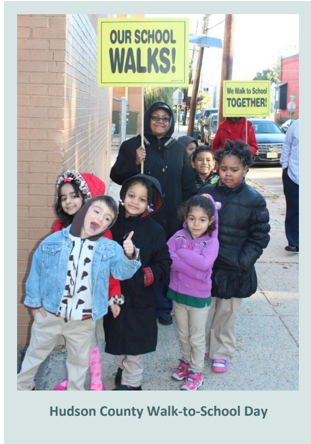
Hudson County Walk-to-School Day

The intent of this report is to share highlights of the key topics discussed in the interview sessions and to propose next steps to be pursued by the VTC team, subject to approval from NJDOT, to assist the SRTS Coordinators as they pursue and implement more inclusive SRTS programs and events.