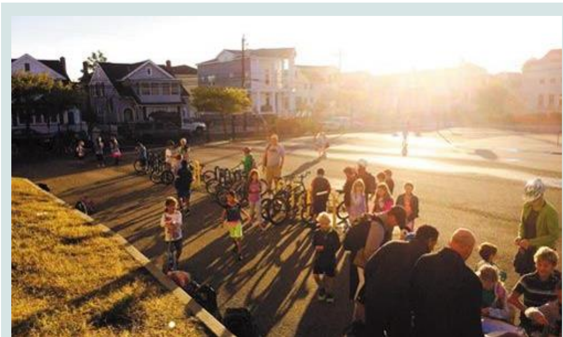
CCC TMA conducts a Walk to School Day in Margate, NJ

Providing the support and resources recommended in this report for the SRTS Coordinators to proactively plan and implement inclusive SRTS events and activities will enable the advancement of the federal SRTS goal of including more children with disabilities in SRTS and evolving the NJ SRTS program toward becoming a national model of inclusiveness of students with disabilities and special needs in statewide SRTS programs.