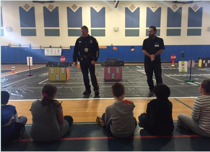
A TransOptions event at Memorial Elementary School in Washington, NJ

interview process. As the TransOptions coordinator recommended, when planning inclusive events SRTS coordinators need to be proactive instead of reactive and discussing the program goal of inclusiveness is “...the first thing we should mention when we meet new people at schools.” In total, all SRTS Coordinators interviewed openly shared a variety of suggestions and thoughts related to how SRTS inclusiveness can be better achieved.