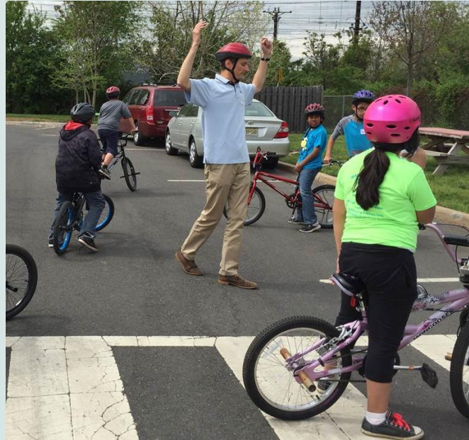
A Bike School event at a New Brunswick charter school

the school makes it difficult to motivate teachers to establish a working partnership with him. The Coordinator from RideWise added that school staff turnover can also negatively impact development of sustained positive relationships with any given school, which can in turn hinder organized involvement of students with disabilities in SRTS programs.