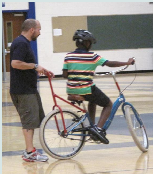
A student rides a bike equipped with an assistive device