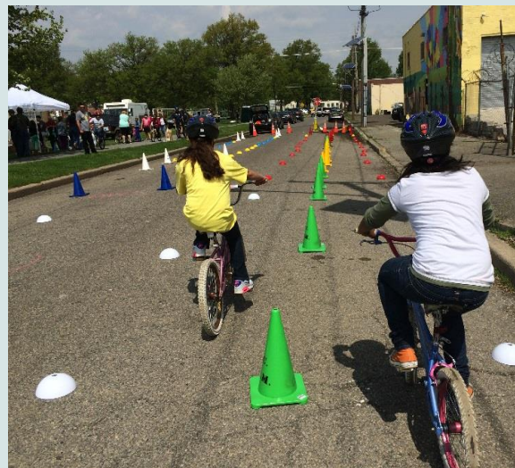
A bike safety event conducted by CCC

Several coordinators also recommended pursuit of specific SRTS inclusive events. For example, the CCC SRTS Coordinator suggested a Wheel to School Wednesday event, where students without disabilities can help students with physical disabilities travel to school. One