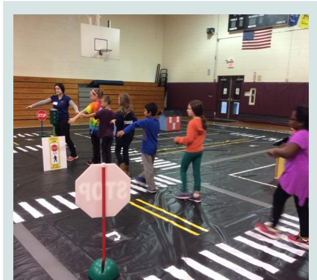
A Safety Town event in Morris Plains, NJ