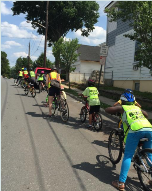
A Bike School conducted by KMM in New Brunswick, NJ