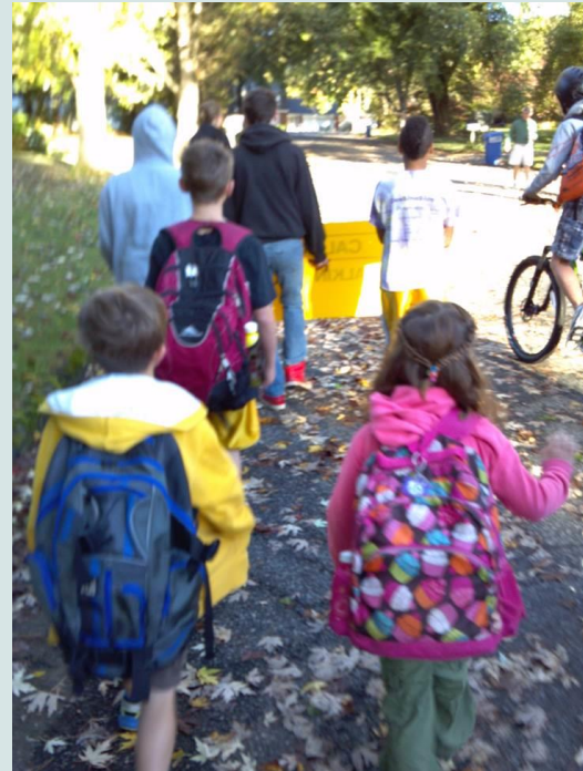
Students participate in a Walking School Bus event

VTC could work with the SRTS Coordinators who expressed interest during the interviews to plan an inclusive event. VTC in partnership with NJDOT and NJTIP@Rutgers (NJ Travel Independence Program whose instructors have the knowledge and experience of working with persons with disabilities to travel safely and independently) and possibly an organization(s) affiliated with a disability category (e.g. autism) could work with the SRTS Coordinators in implementing one or more (decided by NJDOT) SRTS events such as a walk to school day, bike rodeo and/or walkability audit. VTC and NJDOT could also work with a TMA to develop a School Travel Plan including students with disabilities and by identifying and incorporating goals to improve the safety of active travel for students with disabilities. Working with the SRTS Coordinator to plan each event and/or School Travel Plan, discuss and strategize accommodations for students with disabilities, and implement each event and/or School Travel Plan would enable the development of best practices that could be disseminated to and utilized by all SRTS Coordinators.