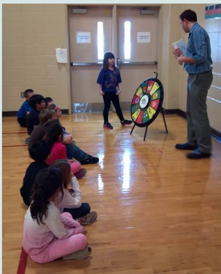
Safety Wheel at a presentation by HART TMA

Notably, each of the eleven SRTS Coordinators opined that accommodating students with disabilities in SRTS programming is a relevant and important goal to be addressed. However, while experiences with inclusive SRTS programming varied somewhat among the coordinators, in general, most expressed limited encounters in planning and implementing SRTS programming for children with disabilities, with the majority indicating their inclusion of children with disabilities has been unplanned. SRTS Coordinators have typically realized during or immediately after the conclusion of a given SRTS event that students with disabilities participated and were accommodated. A Meadowlink SRTS Coordinator offered the example of a hearing impaired student receiving assistance from a school staff member who interpreted using sign language to facilitate participation in a school bicycle rodeo. The SRTS Coordinator from CCC TMA shared the experience of being given a microphone by school staff to wear during his presentation so hearing impaired students could participate, while the HART SRTS Coordinator reported on students with down syndrome and students on the autism spectrum participating in various walk to school events and safety presentations without prior planning for their involvement. The SRTS Coordinator from CCC also reported on how a student with a