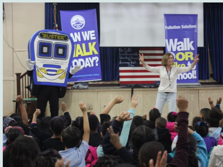
A safety presentation conducted by Hudson TMA