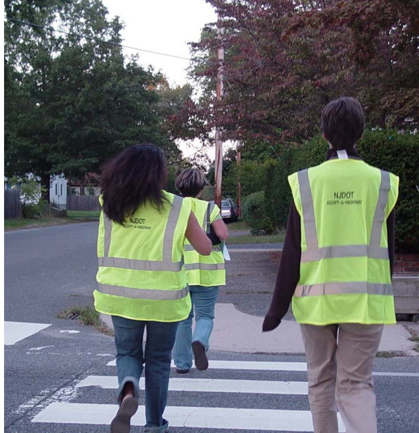
Above right: Walkability audit Below: Walking School Bus, Midstreams School

The NJ SRTS Resource Center supports public officials, transportation and health professionals, and the general public in creating a safer and more accessible walking and bicycling environment through primary research, education, and dissemination of information about best practices in policy and design. The NJ SRTS Resource Center is supported by the NJ Department of Transportation with funds provided by the Federal Highway Administration. The NJ SRTS Resource Center is managed by the Alan M. Voorhees Transportation Center, at the Edward J. Bloustein School of Planning and Public Policy at Rutgers, The State University of New Jersey.