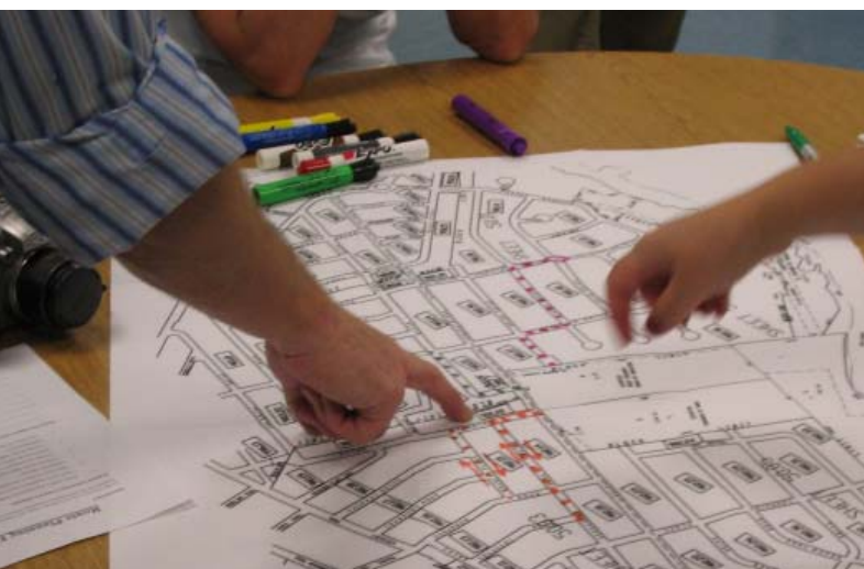
Pedestrian route planning, Midstreams School