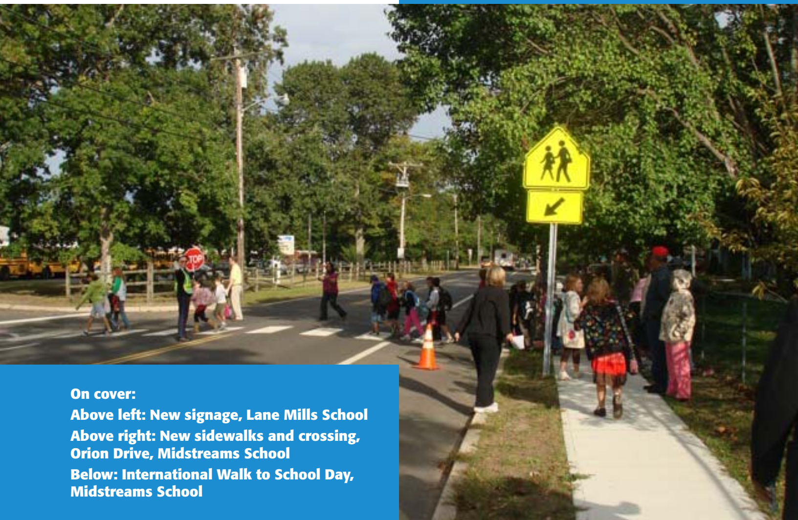
On cover: Above left: New signage, Lane Mills School Above right: New sidewalks and crossing, Orion Drive, Midstreams School Below: International Walk to School Day, Midstreams School