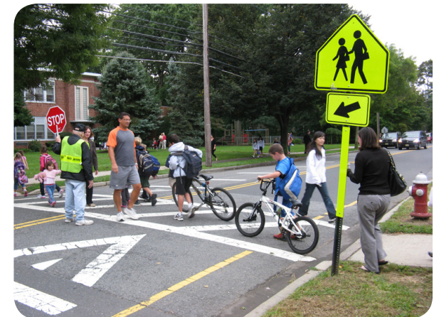
Students crossing in Ridgewood, NJ.

The goals of the SRTS Program are to encourage more students to walk and bike to school where it is safe to do so and to improve the areas where it is not safe.