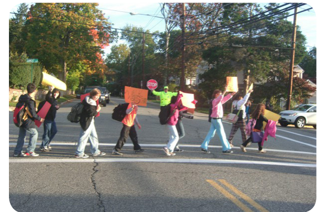
Walk to School Event in Tenafly, NJ.