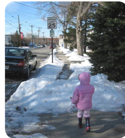
Snow blocks the child's path.

While snow and ice removal is typically the responsibility of the abutting property owner in New Jersey, municipalities should consider taking on snow removal responsibility along identified routes to school. Municipalities should also inform residents of any designated school routes and give priority to helping those who need assistance with snow removal or other sidewalk repairs, such as elderly or disabled residents.