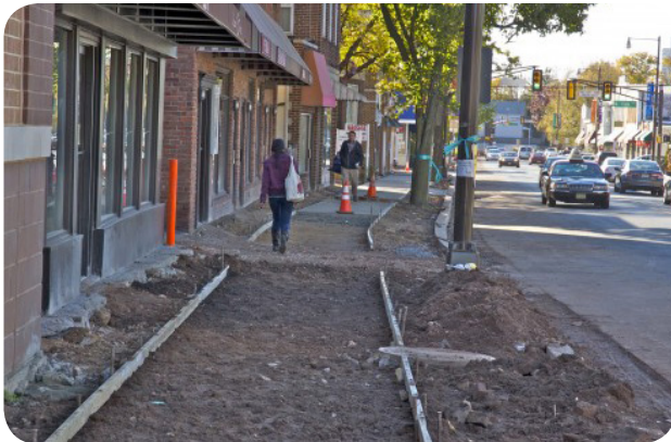
Sidewalk ready to be poured.

When homeowners and businesses are responsible for sidewalk maintenance, they might decide to hire a contractor, perform repairs on their own or have the city do the repair. Homeowner associations in some neighborhoods address right-of-way maintenance as a group to minimize the cost to individual members. In some areas, the city will subsidize sidewalk repairs for property owners. Local laws may also dictate whether or not a homeowner must hire a professional contractor to undertake sidewalk repair. Regardless of the approach for sidewalk maintenance, municipal inspectors should review and approve all repairs to guarantee that the improved sidewalk meets pedestrian access needs and the requirements of the ADA.