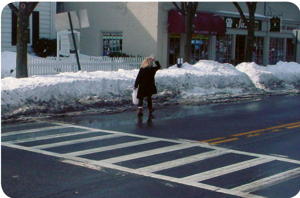
A pedestrian is stranded in the street by snow blocking the midblock crosswalk.

Many local governments require property owners to remove snow/ice from an abutting sidewalk after a winter storm. The laws regarding snow and ice rules and regulations vary across the state. Municipalities may have different time limits on how long sidewalks can remain covered and where the snow can and cannot be shoveled. Often these ordinances and/or maintenance plans do not fully address the need to clear snow from other adjacent pedestrian facilities, such as curb ramps, crosswalks, pedestrian islands/medians, transit stops/shelters, walkways on bridges, and year-round trail systems. In addition, higher mounds of snow frequently develop at street intersections, blocking crosswalks and reducing intersection sight distance.