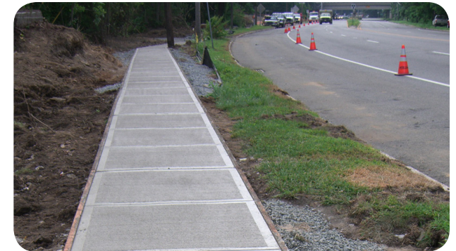
New sidewalk.

According to the RSIS, sidewalks shall be provided on both sides of the street when the minimum lot size in the development is smaller than two acres and the development is located within two miles of a school, regardless of road classification (N.J.C.A. 5:21-4.5). Since there is no comparable set of statewide standards establishing requirements for nonresidential developments, the circulation element to the municipal master plan can provide further guidance regarding where and when sidewalks and walkways should be constructed and how they should be designed. A municipality should identify locations for proposed sidewalks on the Circulation Plan Map within the municipality's adopted Master Plan.