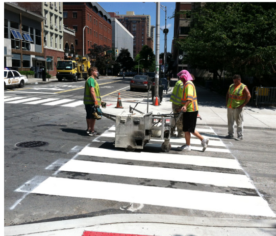
Installing high visibility crosswalks in Hoboken, NJ.

The plan should clearly specify the frequency of maintenance activities and how reported maintenance concerns will be addressed. The development of the plan should be coordinated between the Departments of Public Works, Engineering and Planning, the School District, and the agencies that have jurisdiction over the rights-of-way included within the school zone.