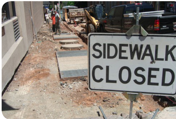
Sidewalk closed for repairs.