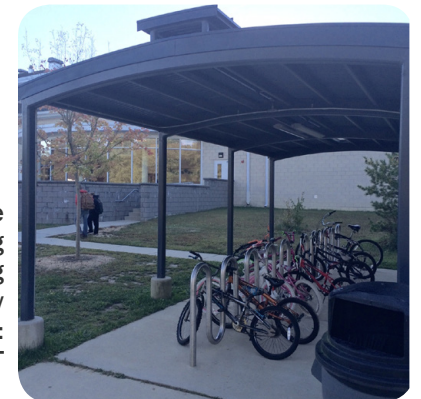
Covered bicycle parking at Egg Harbor's Spragg Elementary School.

The ribbon rack on the left is preferred because unlike the comb rack on the right, it allows both the frame and wheels of the bike to be locked.