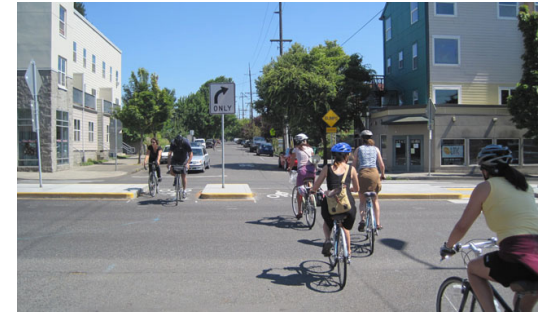
Example of a raised median along a bike boulevard.