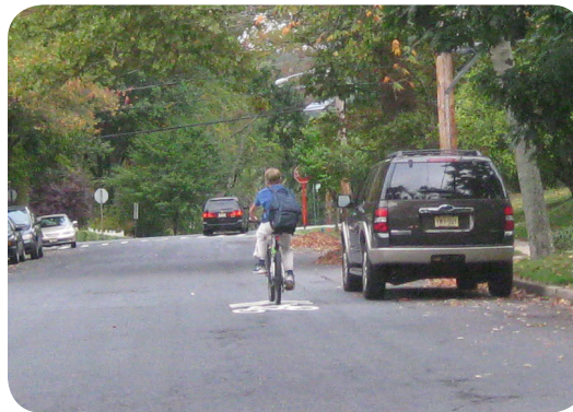
A student riding a bicycle over a sharrow in Maplewood, NJ.