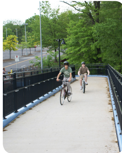
A pedestrian bridge provides access from Immaculata High School in Somerville, NJ to the Bridgewater Commons Mall over Route 202/206.