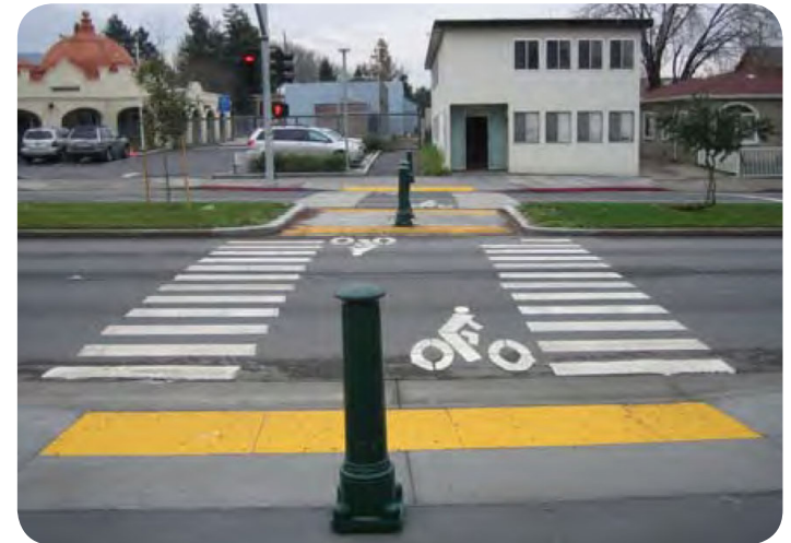
A crossbike in Berkeley, CA.

When to Use/Typical Application: Where main bicycle routes cross relatively minor collectors; where cross traffic has to yield right-of-way to crossing bicyclists; not appropriate where speeds exceed 30 mph unless signalized.