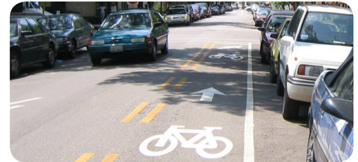
A contra-flow bicycle lane in Chicago, IL.

When to Use/Typical Application: Where it would provide substantial savings in out-of-direction travel and/or direct access to high-use destinations; where there will be fewer conflicts when compared to a route on other streets; when there are few intersecting driveways, alleys, or streets on the side of the street with the contra-flow lane; where bicyclists can effectively and conveniently make transitions at the termini of the lane.