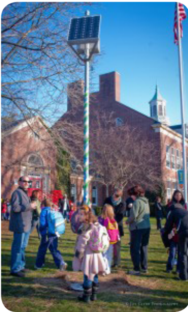
The “zap” machine tracks participants as they arrive at Montclair’s Edgemont School as part of the Boltage Program.