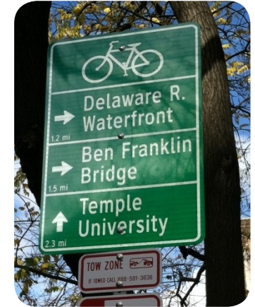
Bike route signs in Philadelphia show distance to destination.

When to Use/Typical Application: Signs are typically placed at decision points along bike routes – typically at the intersection of two or more bikeways and at other key locations leading to and along bicycle routes; signs should be oriented so bicyclists have sufficient time to comprehend the sign and change their course, when needed.