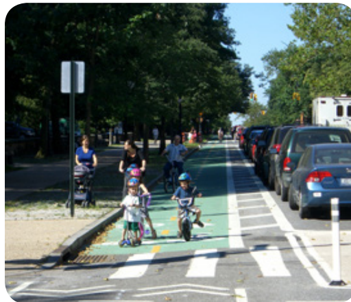
Two-way cycle track buffered by on-street parking.

When to Use/Typical Application: Cycle tracks may be appropriate along roads that have high vehicle speeds and high traffic volume, but few intersections, driveways, and other junctions; along streets with high bicycle volumes; the desirable one-way cycle track width is 5 feet and a two-way cycle track width is 12 feet. Minimum width for a two-way cycle track in constrained locations is 8 feet.