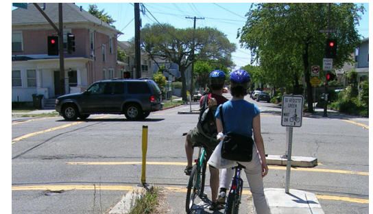
The signal at this crossing is actuated from an in-pavement loop detector.