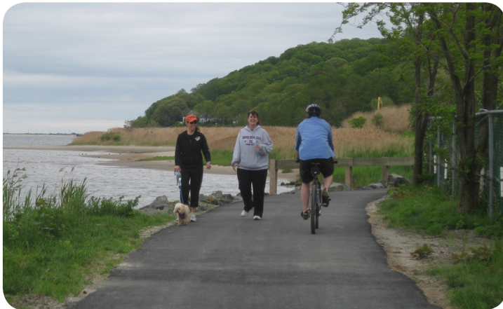
The Henry Hudson Trail in Monmouth County, NJ is an example of a shared use path.

When to Use/Typical Application: 10 feet is the recommended minimum width for a two-way, shared use path on a separate right-of-way; 2 feet of graded area should be maintained adjacent to both sides of the path and 3 feet of clear distance should be maintained between the edge of the trail and lateral obstructions; shared use paths fall under the accessibility requirements of the Americans with Disabilities Act (ADA).