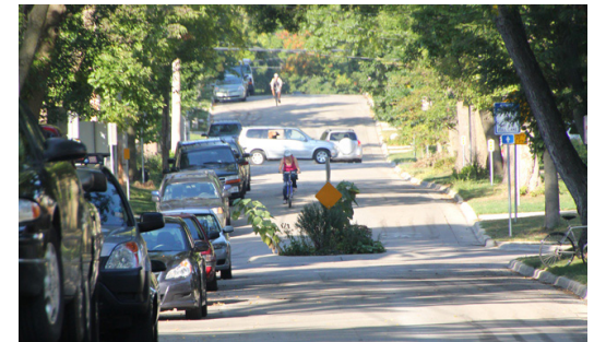
Mini traffic circles may be used to lower motor vehicle speeds near intersections with bike boulevards.