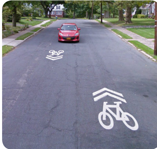
Sharrows on a residential street in Maplewood, NJ.

When to Use/Typical Application: When there is insufficient width to provide bike lanes; on a steep downgrade; shared lane markings are not a preferred treatment on streets with posted 35 mph speeds or faster and motor vehicle volumes higher than 3,000 AADT; sharrows shall not be used on shoulders or in designated bicycle lanes; they should be placed immediately after an intersection and spaced at intervals not greater than 250 feet thereafter.