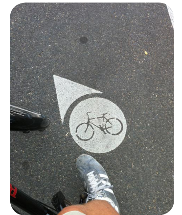
Bike Dots are pavement markings for signed bicycle routes. They are a tool to provide wayfinding.