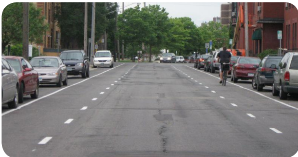
Advisory bicycle lanes in Minneapolis, MN.

When to Use/Typical Application: Roads that are too narrow for conventional bike lanes; roadways with low traffic volume; only used on roads without marked centerlines; used in both rural and urban areas.