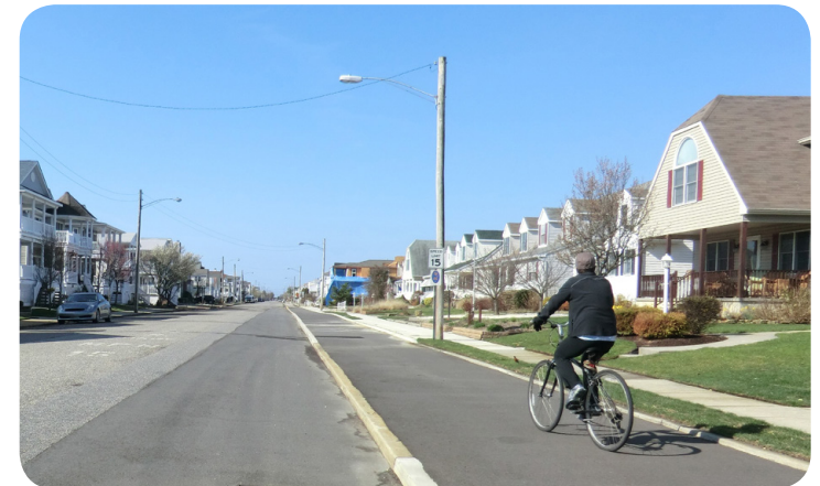
A raised cycle track in Ocean City, NJ.