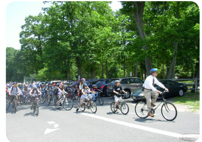
Students bicycling from elementary to middle school on “Transition Day” in Fair Haven, NJ.