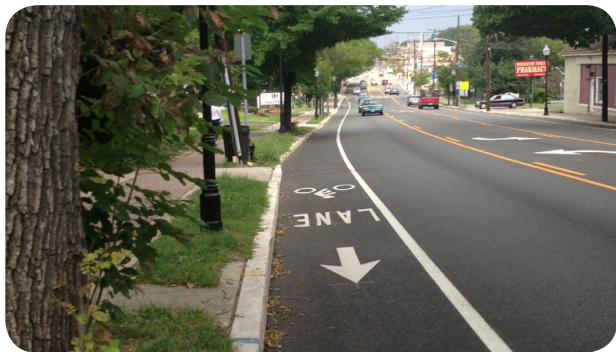
A bike lane along Route 45 in Woodbury, NJ.

When to Use/Typical Application: Bike lanes are most helpful on streets with \geq 3,000 motor vehicle average daily traffic, a posted speed \geq 25 mph, or high transit vehicle volume; they should typically be provided on both sides of two-way streets to prevent wrong-way riding; the preferred width for young cyclists is 5 feet.