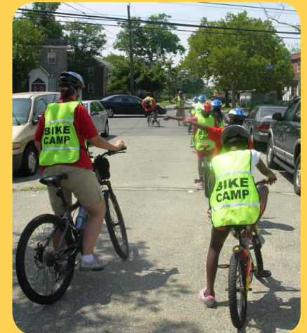
NJBIKESChOOL in Camden, NJ.

The program is currently being managed by Hudson TMA. This program can become part of a school's physical education program at no cost to the school district. Staff from the Hudson TMA will train physical education teachers and provide the curriculum. A fleet of bikes will also be loaned to the school for a period of three weeks for the children to use as part of their gym class. Many school districts in Hudson County have been participating in the NJ BIKESChOOL program and reports indicate that the children love it. To learn more about this program or request that it be presented at your school, contact Hudson TMA at (201) 792-2825 or info@hudsontma.org