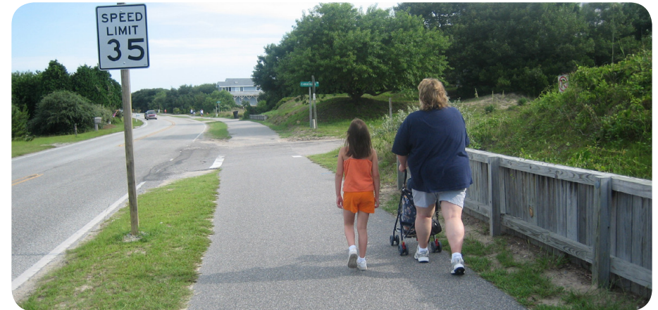
Example of a sidepath.

When to Use/Typical Application: Where right-of-way or other physical constraints prohibit path alignment in independent rights-of-way and there are no practical alternatives for improving the roadway or accommodating bicyclists on nearby parallel streets; when the sidepath can be built with few street and/or driveway crossings; when the adjacent roadway has relatively high-volume and high-speed traffic; the minimum recommended distance between a path and the roadway curb is 5 feet. When the separation is less than 5 feet, a physical barrier or railing should be provided; utilizing or providing a sidewalk as a shared use path is undesirable.