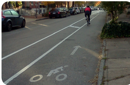
A buffered bike lane in Philadelphia, PA.

When to Use/Typical Application: Buffered bike lanes should be considered on streets with high traffic volume, regular truck traffic, high parking turnover and a speed limit > 35 mph.